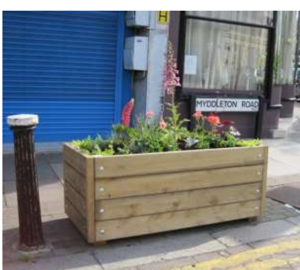
One of the new planters in Myddleton Road