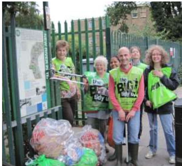
Tidying up the New River path