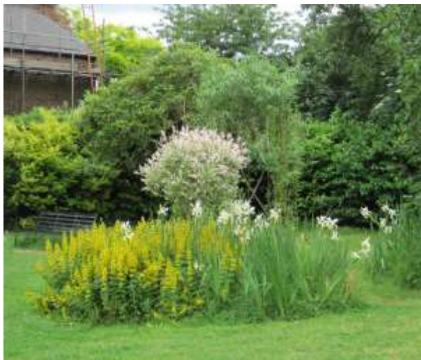
The community garden in flower